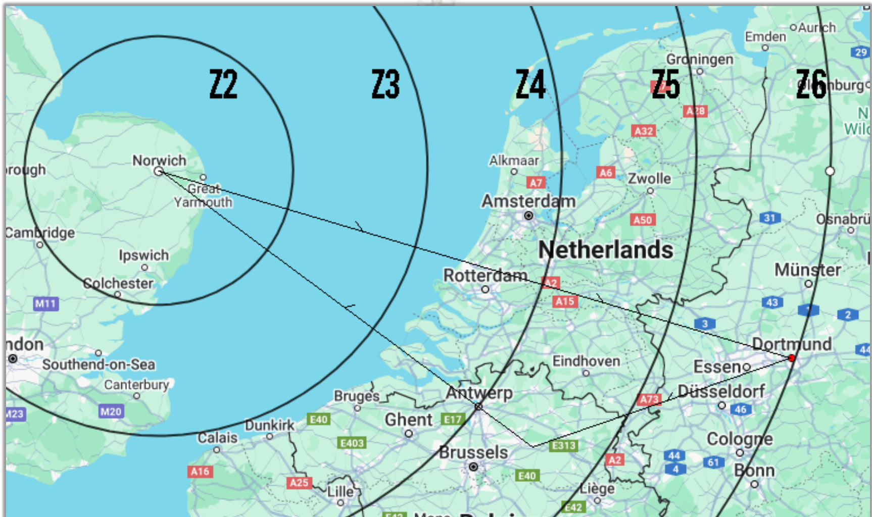
Dortmund Germany Navigation Map